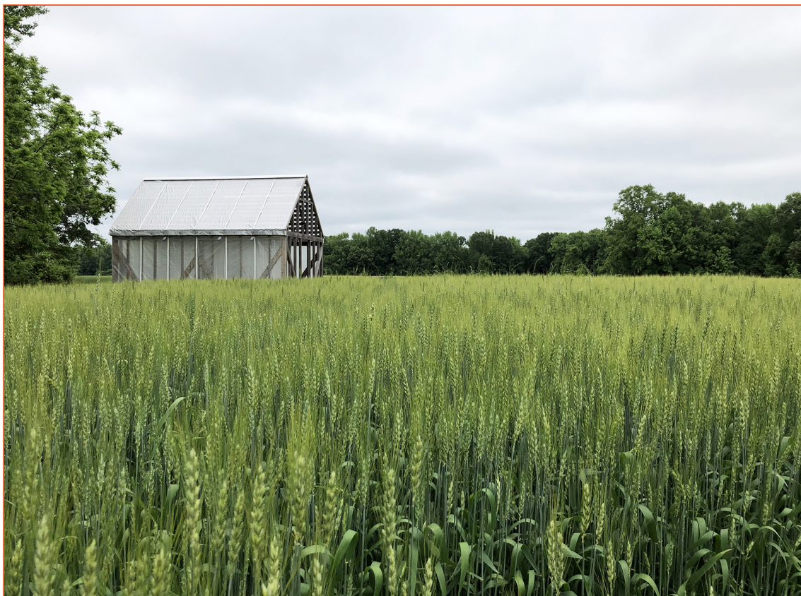
REMEMBRANCE STRUCTURE ON THE GROUNDS OF THE MENOKIN FOUNDATION, WARSAW, VA