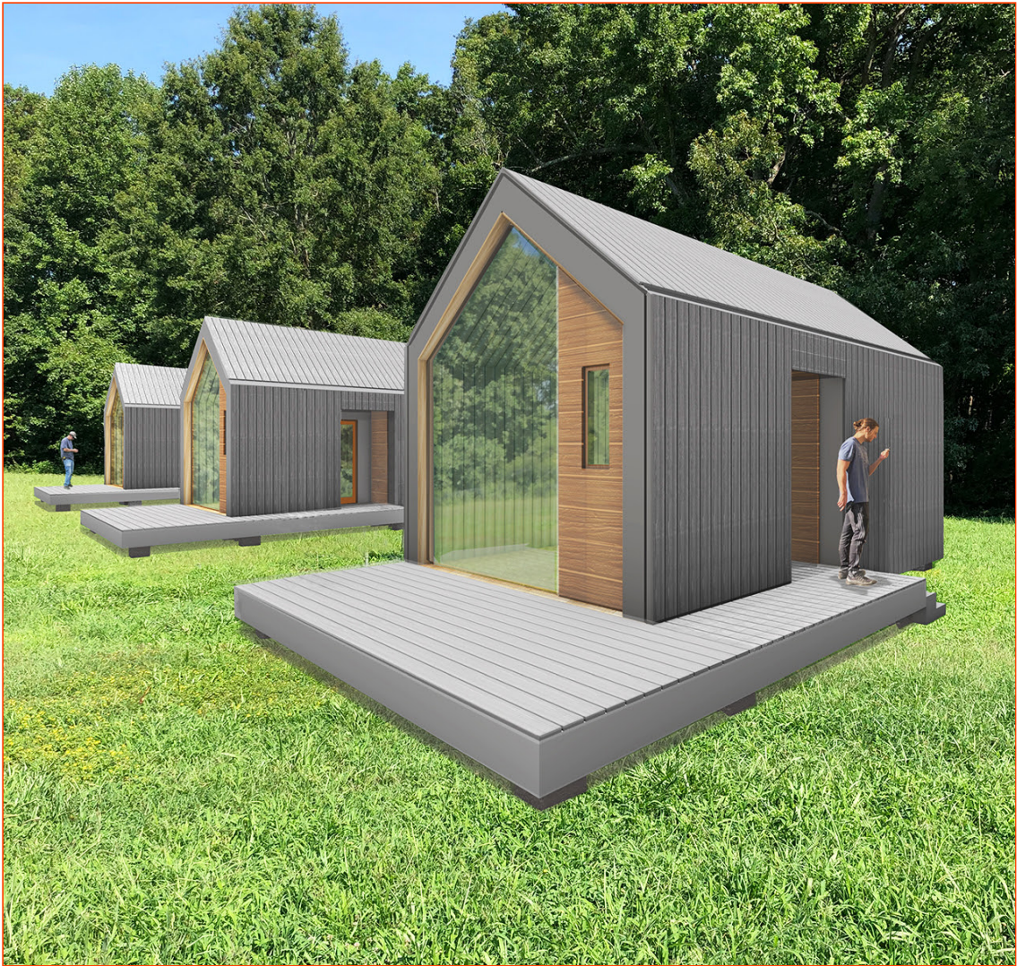
MENOKIN GUEST CABINS, WARSAW, VA